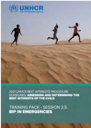
Click the image