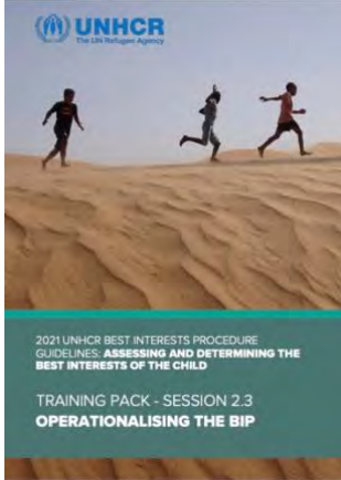
Click the image