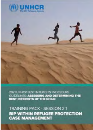
Click the image