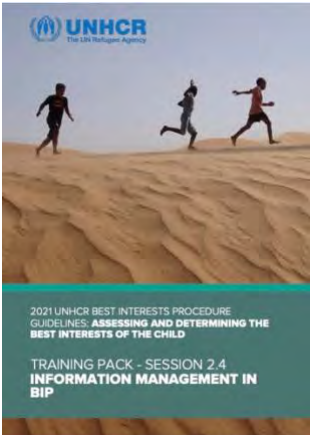
Click the image