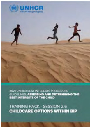
Click the image