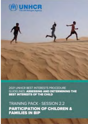
Click the image